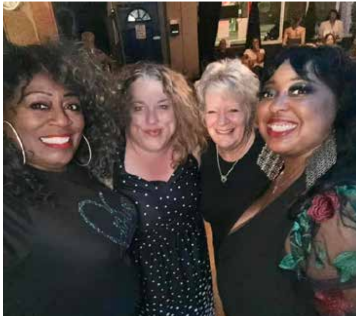
Happy to hang out with Lady A

Audiences were privy to some of the best in local and national talent on stages such as the Waterfront Blues Festival and Winthrop. As summer is winding down, don't forget that some of your newly found out-of-town favorites will be coming through on additional tours when the days are darker.