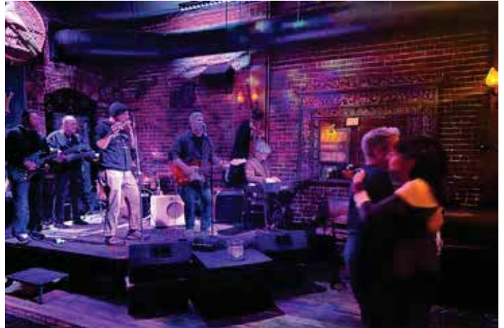
Blues Jammers at White Eagle